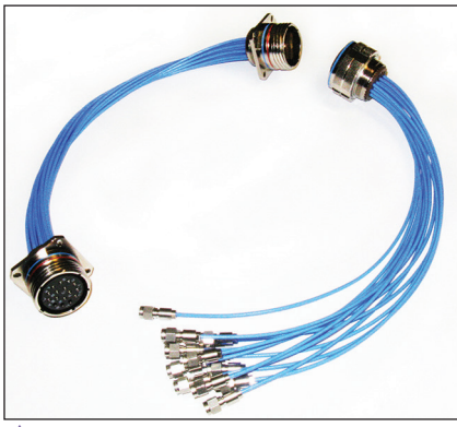
▲ Fig. 2 SSBP high performance coax contacts for use in standard MIL-DTL-38999 and other multiport connectors solve the space, weight and performance challenges of standard interconnect cabling.

▲ Fig. 1 SSBP size (using signal contact sizing terminology) vs. millimeter wave transmission line diameter "A". The maximum frequency depends on contact size and cable application.